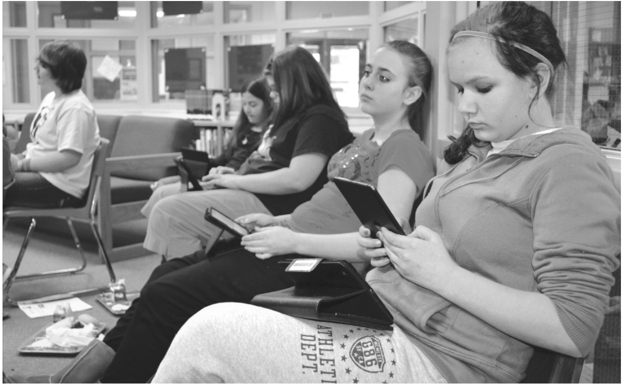
Middle school students use their iPad minis at East Jordan to take notes while attending a presentation in the media center.