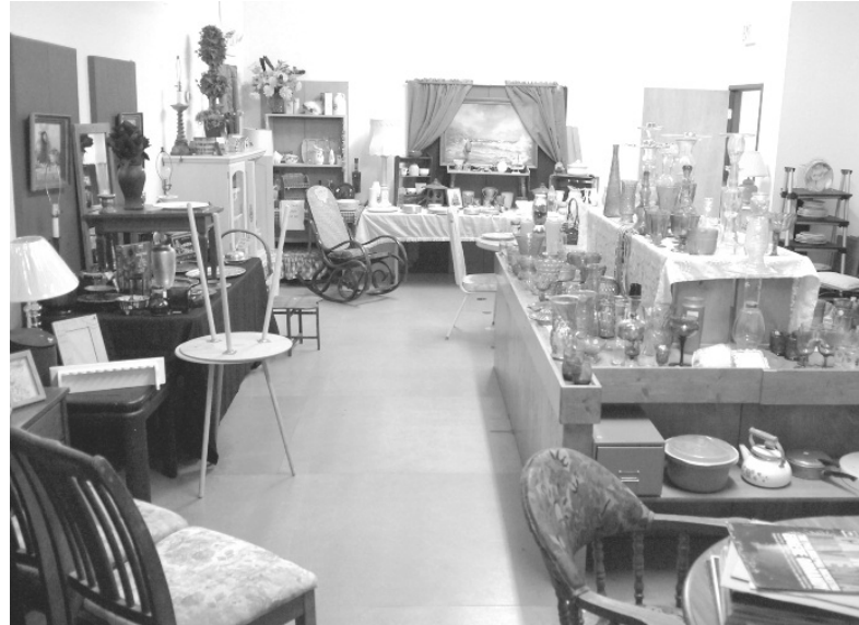
Display areas are nicely organized into separate rooms for adult and children's clothing, a household furniture and accessories area (shown here), a "library hall" with books, CD's and DVD's, plus a general display area with even more furniture, artwork, tools, camping and sporting gear and more.

"We offer our customers a very organized, detail oriented shopping experience," affirms Rogers. "Our goal is to make shopping at Four Seasons Resale of the North as easy and enjoyable as possible. I look for items for our store that are of good quality, which I can purchase and have a small mark up, and still offer to my customers at an exceptional value."