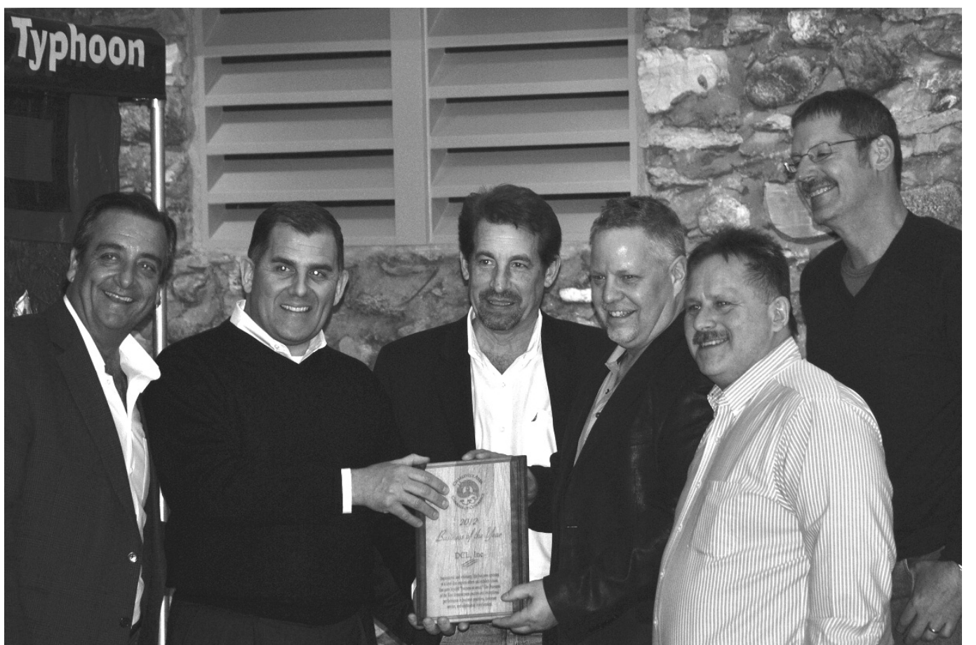
BUSINESS OF THE YEAR: DCL