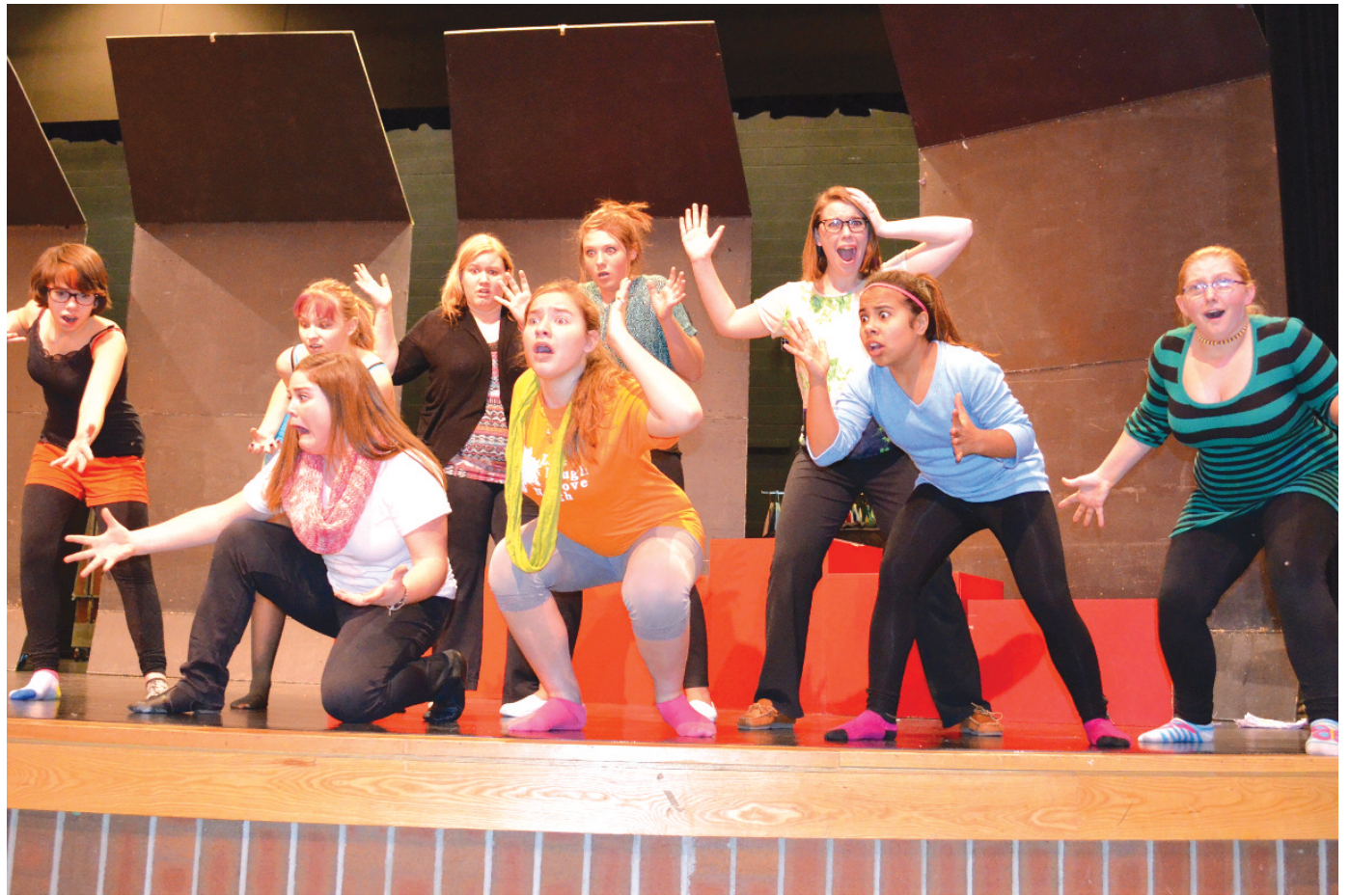
East Jordan middle and high school students rehearse numbers for the musical mystery "Who Dunit." Having teamed up with Ragamuffin Theatre & Company, thespians will perform the fast paced comedy March 16 & 17.