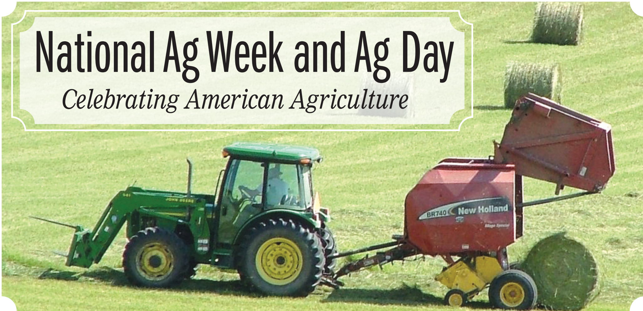
It is National Ag Week, and within that week the 40th annual celebration of National Agriculture Day will take place on March 19th. Advances in technology over the last century have transformed much of the haying work to a single person event.